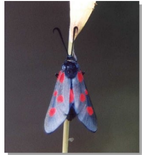
Narrow-bordered five- spot Burnet moth Zygaena lonicerae

However no butterflies were seen in the large meadow on the South East of the site. This area normally produces the largest number of butterflies. I think a May cut of the grass has brought about this situation and the mowing regime will have to be altered.