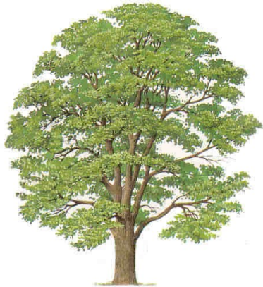
Wych Elm - Ulmus grabra

The silver lining to the abysmal wet weather of the early part of our summer was the survival of nearly all of the elms planted last winter; indeed, several have grown by as much as half a metre. In June we received several thousand seeds of the American hybrid "Accolade" ( U.japonica X U.wilsoniana ) donated by the Morton Arboretum, Illinois together with seeds of the "David Elm" Ulmus davidiana , a little-known species from China. Meanwhile, the Curator of the Royal Botanic Garden at Wakehurst Place has offered to propagate for us some of their rarest elms U.bergmanniana and U.wallichiana which are the Wych Elm's closest relatives in China and the Himalayas respectively.